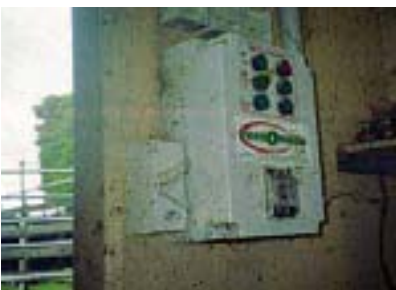
The feed system in this dairy can be isolated by the switch on the left. A lock or tag can be placed through the switch to prevent accidental operation while conducting maintenance.