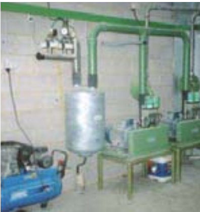
Vacuum pumps are well guarded in a separate room with exhaust directed away from the dairy.