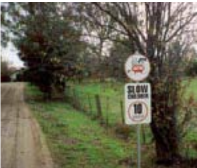
Established speed limits in and around the farm and dairy.