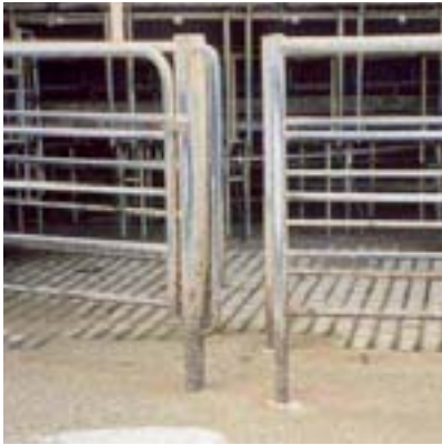
A strategically located 'escape'.