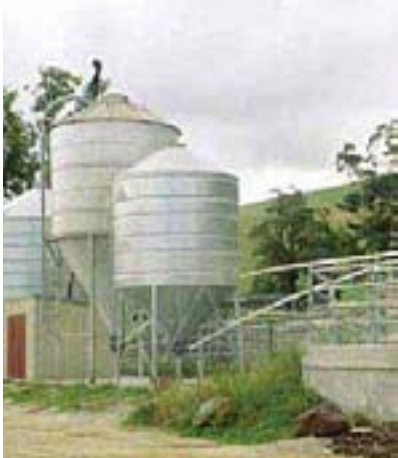
Steep coned silos empty completely and eliminate the need to enter them to remove grain.