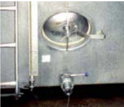
A bottom access hatch on a milk vat.