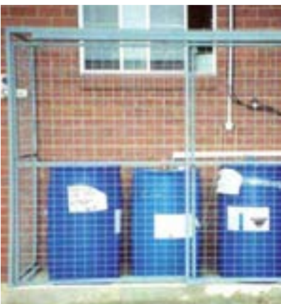
Caustic cleaners in a locked and bunded enclosure.