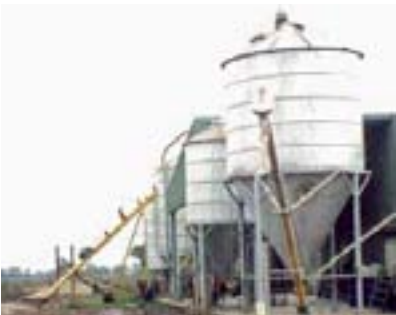
Silos with steep cones that ensure complete emptying and bottom inspection.