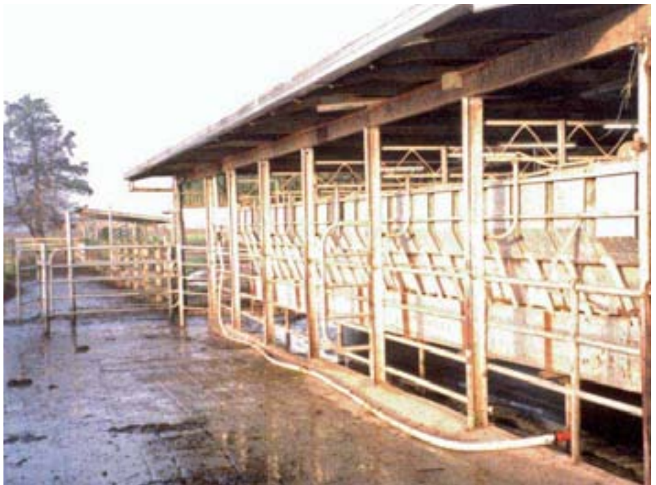
Well ventilated dairy.

It is important to remember that sun damage can occur within 15 minutes of sun exposure during the summer months, and within a couple of hours in winter, even on an overcast day.