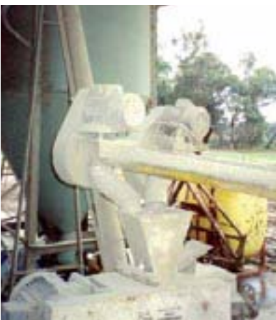
Feed processing external to a shed assists in dispersing noise.