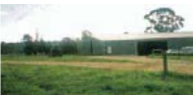
A good tanker access area with a well-maintained track and separate vehicle parking area.

The presence of milk tankers, feed and fuel trucks can present a high risk of serious injury or property damage if the limitations of the vehicles are not considered when designing or maintaining the yard.