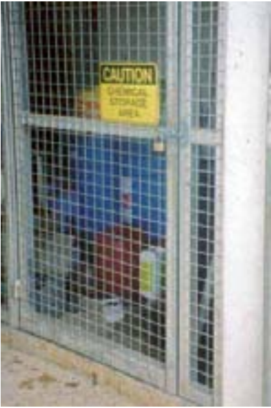
Secure and locked chemical storage in the dairy with concrete floor and bunding to contain spills.