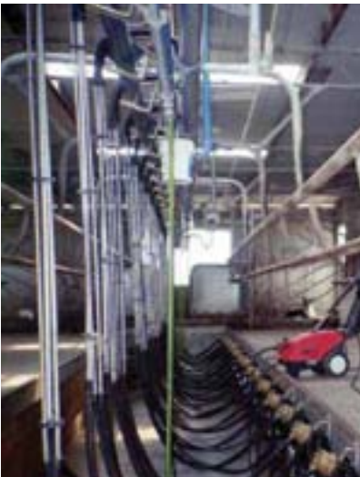
A power washer can be used as an alternative to chemicals to remove algae in the dairy.

Chemicals can build up in the body over a period of time or the effects of poisoning can occur very quickly. Some farm chemicals are also known to cause cancer, while others can cause nervous or reproductive disorders, damage to internal organs and skin problems. Some chemicals are also flammable, which represents an added risk of explosion and fire.