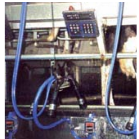
The cluster height on this ACR matches the needs of the operators.