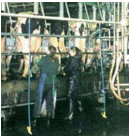
Working as a team at the cups-on position in a high throughput rotary dairy.