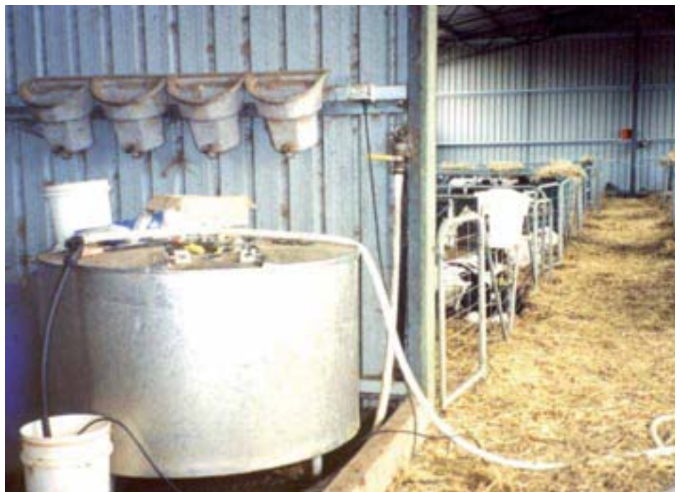
Bulk handling of calf milk.