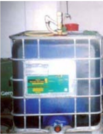
Bulk handling of chemicals eliminates some manual handling issues.