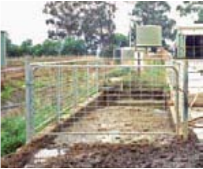
Fenced off solids trap by the dairy.