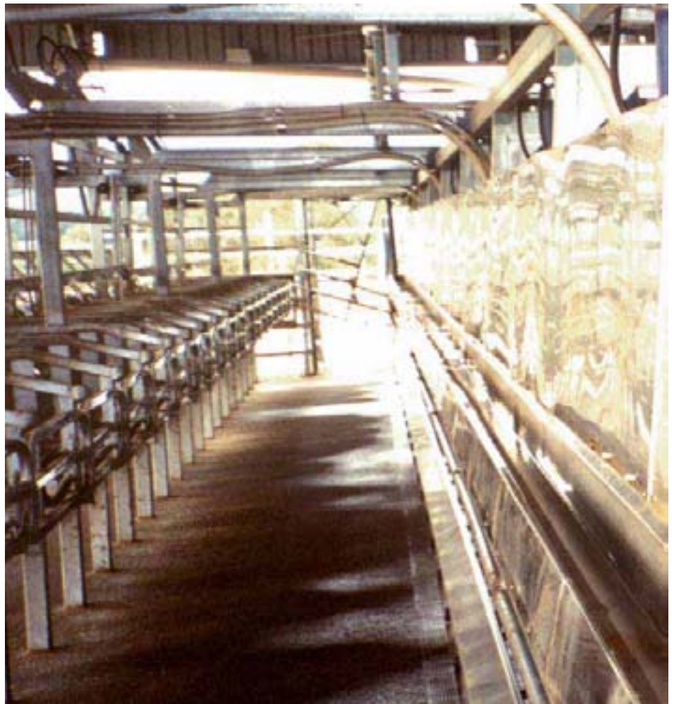
Splashguard in a herringbone dairy.

The effects of these diseases can vary in seriousness from severe flu-like symptoms (for example Leptospirosis, Q Fever), gastroenteritis (e.g. Salmonellosis), through to death (such as from hydatid disease), or the death of the developing human foetus during pregnancy (e.g. toxoplasmosis, a disease principally contracted from cats).