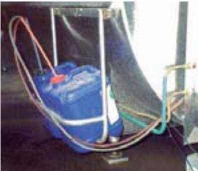
Modern closed cleaning systems reduce the need to enter the vat for cleaning and minimise the handling of chemicals.