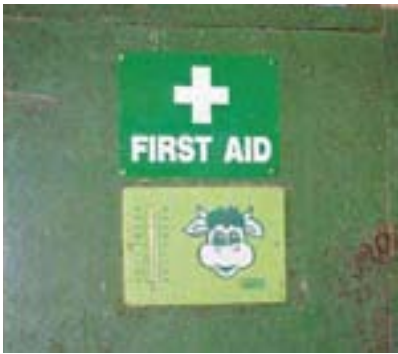
Signage that shows the location of the first aid kit.