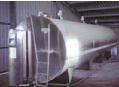
When upgrading milk vats purchase one that does not require entry for cleaning.