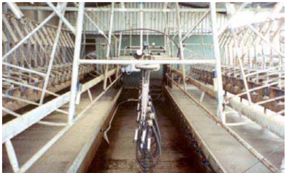
An example of good housekeeping. This image shows an uncluttered, spacious and light dairy without tripping hazards. Chemicals are returned to the chemical store and hoses are laid out of the way.

If a hazard can be eliminated there is no risk of injury. An easy way of eliminating hazards is at the first stage of purchasing or installing a piece of equipment, building a shed or purchasing a chemical.