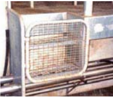
Restricting child access to the rapid exit system.