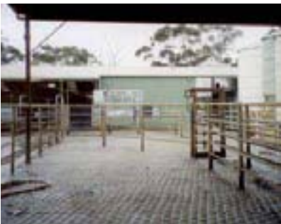
Non-slip yard surface for cows and people.