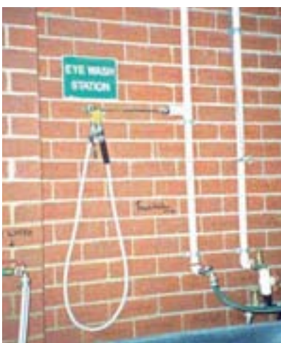
Eye wash facility for where acids and alkalis are used.