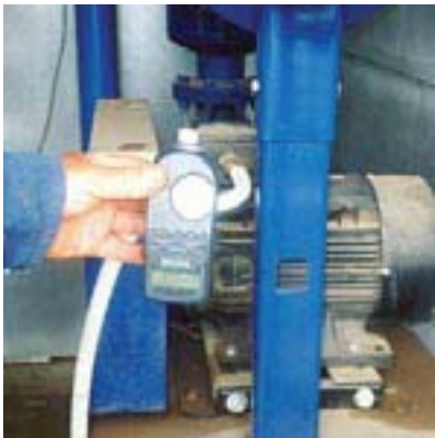
This handheld sound meter provides guidance on the noise level of vacuum pumps.