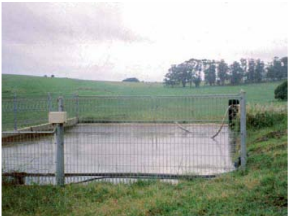
Fenced off effluent pond in paddock near the dairy.

Poorly managed effluent ponds, dairy sheds and yards can help disease to spread and can lead to young children being exposed to the risk of drowning. Effluent ponds can allow a build-up of a crust and subsequent weed growth over the surface of the effluent pond. The crust may look like solid ground but it will not stand the weight of a person or animal and they may fall through the crust and into the effluent pond. Ineffectively drained areas can increase the risk of slips and falls for livestock and workers. Inadequate waste management also increases the health risks associated with flies and insects.