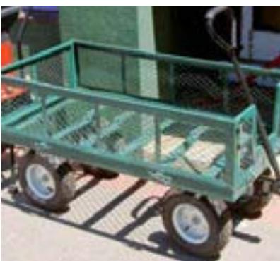
This four wheeled trolley is a useful aid for a range of manual handling activities.