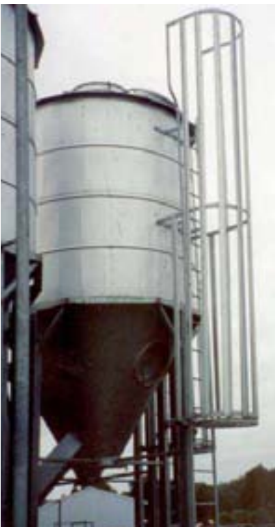
Ladder cage that incorporates a locked restricted access panel.