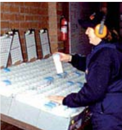
A tilted herd testing table that minimises bending and reduces reaching.