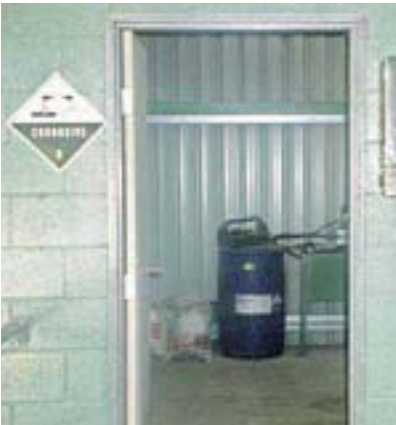
Safety signage indicates that corrosive acid and alkaline dairy detergents (Dangerous Goods) are stored or are in use in this room.