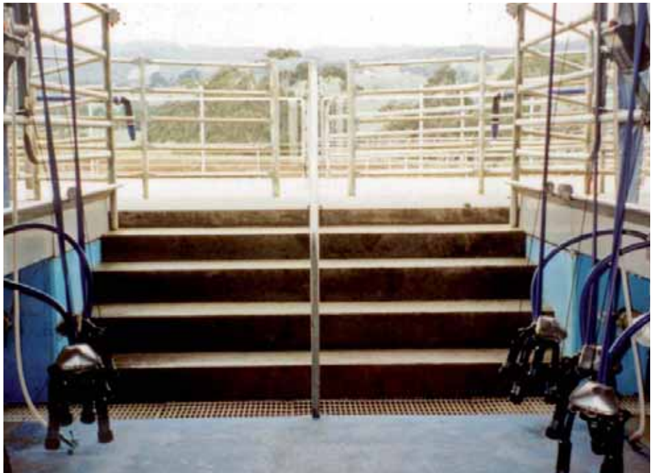
Wide, solid steps that provide access to the pit.

There are many basic housekeeping, equipment and design processes that will reduce the likelihood of slips and trips in dairies. Tripping hazards include, different floor levels, broken concrete, poorly located pipes and hoses, and badly designed steps.