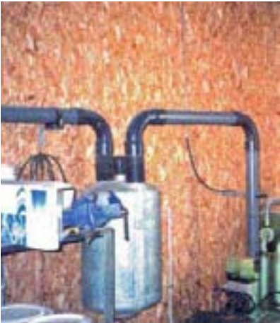
Isolated and insulated plant room.