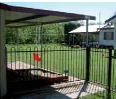
A safe play area within the house yard.