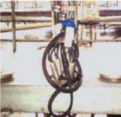
A herd sample flask located at a height that reduces bending.