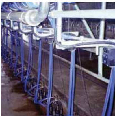
This herringbone dairy has been refitted with new milk lines and upgraded with Automatic Cup Removers.