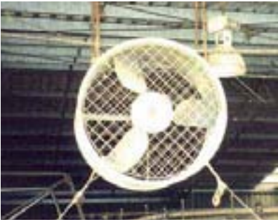
Strategically located cooling fan in rotary dairy.