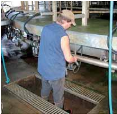
A rotary dairy pit, with removable grate, can reduce manual handling hazards by allowing for workers of various heights.