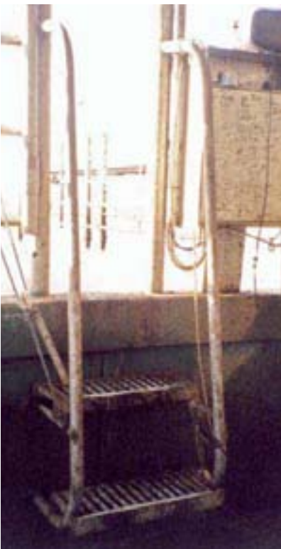
Non-slip step with handrails for yard entry from a rotary dairy.