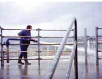
A hydrant hose will eliminate the dragging of hoses however care should be taken to ensure children are not around when they are in use.