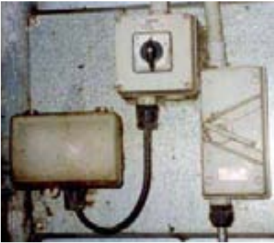
Waterproof cover on power outlet in the dairy.