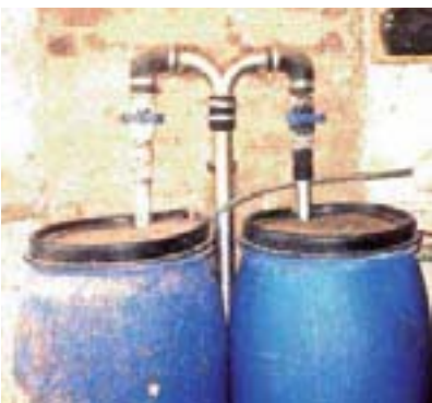
A closed thirdline cleaning system can minimise the need to handle buckets of hot water and chemicals. The use of lids and the extension of hoses and pipes to the internal base of the drum substantially reduces splashing.

Manual handling generally relates to an activity where a person is required to use force to lift, push, pull, roll, hold, restrain or carry an object or animal and includes repetitive tasks. With all these activities there is potential for injury to occur.