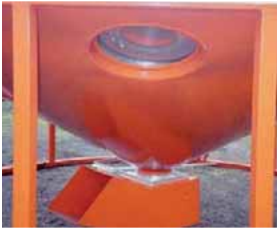
Silos should have a bottom access hatch.