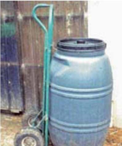
This trolley is a simple mechanical aid for handling drums.