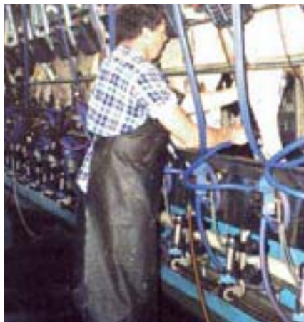
A pit depth and cow position that minimises bending and reaching.