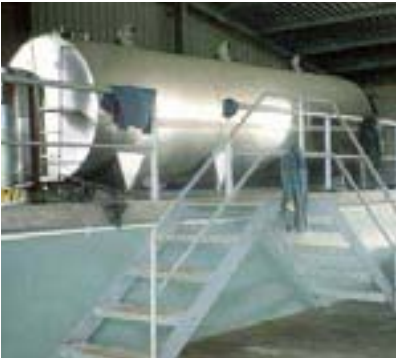
Well constructed steps and handrails.