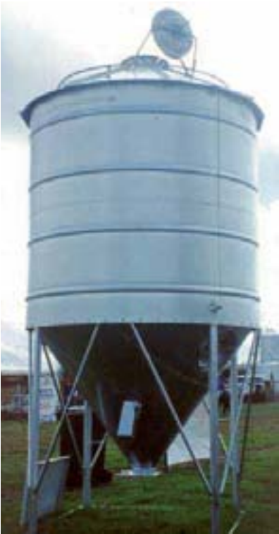
Ground operated lid opener on feed silo.