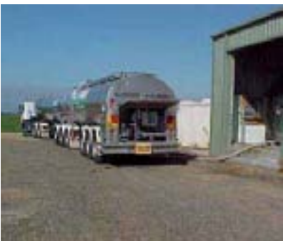
Clear Tanker access is essential. Access should not be blocked by obstacles such as overhead powerlines, trees blocking visibility, or other machinery.