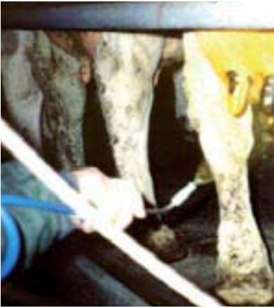
Teat Spray being applied with a long nozzle reducing the risk of inhaling aerosols and being kicked.