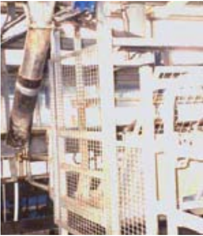
Rapid exit guards reducing the risk of entrapment.