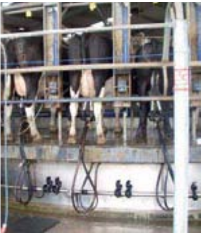
The skirt around the base of this rotary dairy is an effective guard for rollers and nip points.