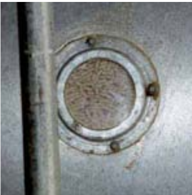
Sight glass fitted to feed silo.