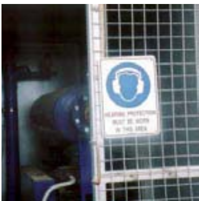
Sign indicating that hearing protection should be worn in this area.

Dairies can be noisy workplaces. A dairy shed has many loud and continuous noises including vacuum pumps, feedshed augers, hammer or roller mills, clanging metal from the shed, and very often a radio that is cranked up to be heard above these other noises.