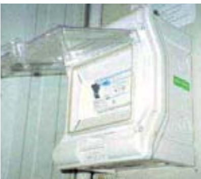
Residual Current Device (RCD) fitted to the dairy's power board. The RCD has its own blue test button.