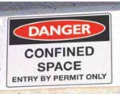
Each silo should have appropriate signage that meets any relevant Australian Standard.

There are several areas on dairy farms that may be classified as confined spaces including milk vats, silos and water tanks. In each of these cases there are ways for eliminating the confined space hazards through safe design. Removing the need or possibility of ever entering these spaces eliminates the risk.