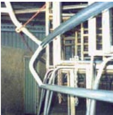
A 'banana rail' reduces the risk of entrapment. Emergency stop lanyard/cord is located above the top rail.