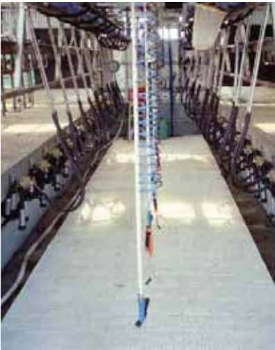
Fans are located in the end walls of this dairy for cooling in summer and are covered with black curtains to prevent drafts in winter.