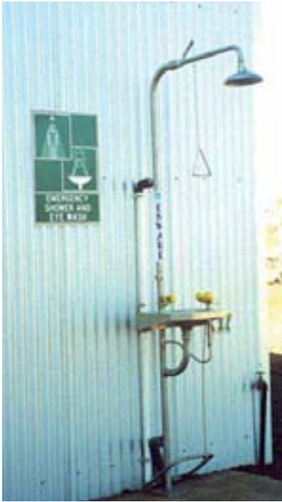
Emergency shower and eyewash outside a chemical store.