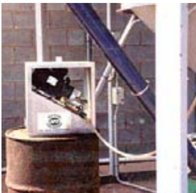
Adding canola oil or other vegetable oil to grain will reduce dust.