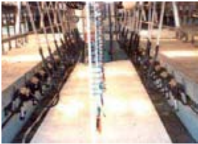
The safety features in this pit include hoses laid down neatly, an uncluttered open design, fatigue matting, and suspended water hoses and teat sprays.