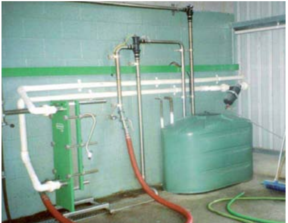
Closed cleaning system that restricts access to chemicals and hot water.

However, good dairy design can go a long way to making them safe for children. Children follow closely patterns set by their parents and other adults. If adults on the farm work safely, then children are more likely to follow their example.