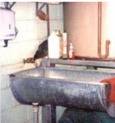
A waist-high trough for washing buckets.