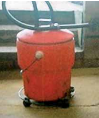
Test bucket on wheels.