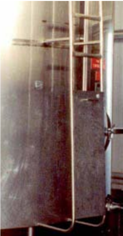
Restricted ladder access to milk silo.

Fall prevention regulations require any work undertaken at a height of more than 2 metres to have the risks assessed to determine the appropriate risk control measures.